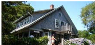
SOMETHING NATURAL nantucket