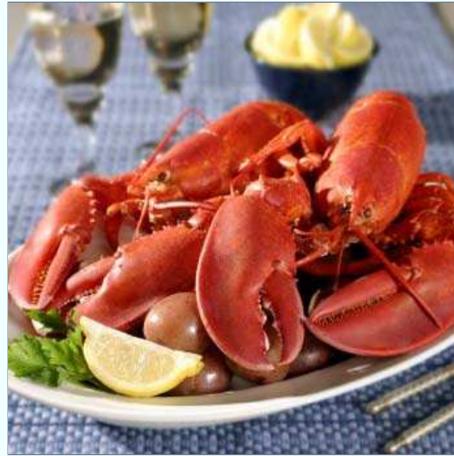
Steamed Lobster Dinner

Soft shelled clams are also called "steamers" and are found only in New England and the Chesapeake Bay. They live in "the flats," the somewhat mucky sand left behind at low tide. You'll literally dig with your hands and pull them loose.