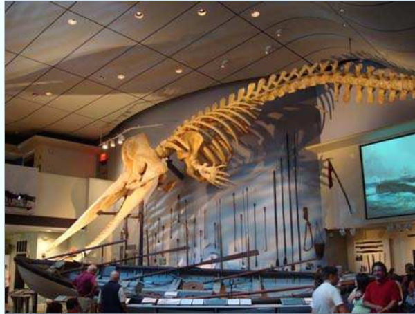
Nantucket Whaling Museum