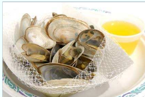
Cape Cod Steamers