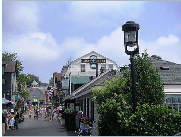
Shopping in Nantucket Wharf