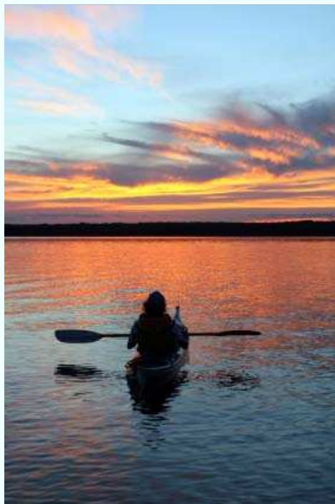
Kayaking throughout Cape Cod

Up on the Outer Cape , Long Point and Pamet Harbor in Truro; Blackfish Creek, Wellfleet Harbor, and Great Island in Wellfleet; and Provincetown Harbor are all popular out and back kayaking spots. These areas are especially choice for sunset paddling.