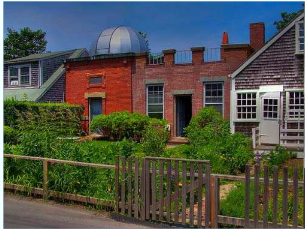
Maria Mitchell Observatory

On a night in October of 1847, a woman stood on the roof of the Pacific National Bank near her Nantucket home with a telescope. This was nothing new as Maria Mitchell had, since childhood, had a love for astronomy. At age 12, she and her father had pinpointed the location of their Nantucket home by observing a solar eclipse. So adept was Maria at astronomy that whaling captains trusted her to plot the navigation for their whaling journeys. Throughout her young womanhood, she acquired astronomical equipment and conducted observations.