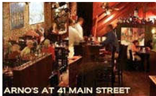
ARNO'S AT 41 MAIN STREET

15 Teasdale Circle, Nantucket ~ (800) 432-1673 ~ www.nantucketcoffee.com