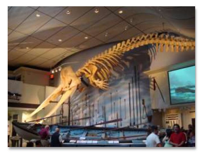
Nantucket Whaling Museum

For nearly 100 years – from the mid-1700's to the late 1830's – Nantucket was the whaling capital of the world with as many as 150 ships making port in