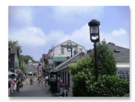
Shopping in Nantucket Wharf

Having fallen into disuse during the Depression following the demise of Nantucket's whaling industry, Nantucket's wharves and cottages sat empty and derelict. In 1920,