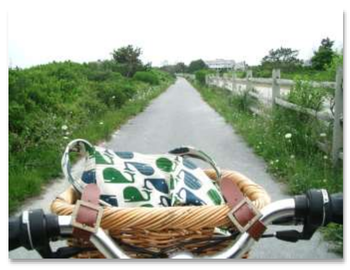
Biking on Nantucket

Nantucket, and most are separated from the roadways, making for a safe ride. Nantucket shuttle buses, equipped with bike racks, enable you to easily access any bike routes. A color-coded sign system helps guide bikers around the island.