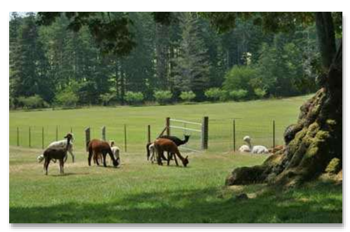
Alpaca Farm, Martha's Vineyard

Martha's Vineyard may be known as the summer playground for the rich and famous, including presidents and their - some of whom own or enjoy beautiful Martha's Vineyard vacation rentals. But it