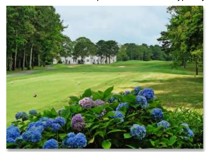
Golfing in New Seabury

The courses on the Cape and Islands are typically