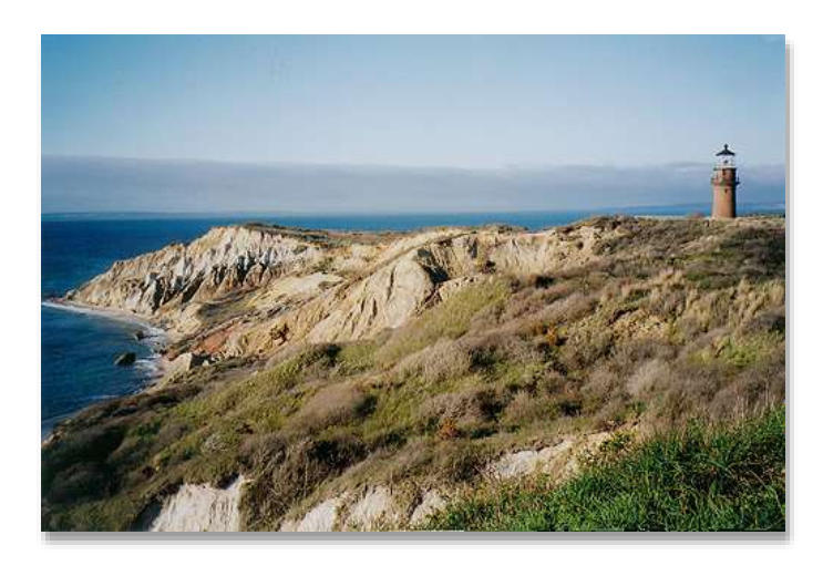
Gay Head Cliffs and Lighthouse, Aquinnah

A drive up through pretty, hilly Chilmark brings you to the town of Aguinnah, formerly called Gay Head. Here you will find the 130 foot tall, beautiful, multicolored clay of the Gay Head Cliffs.