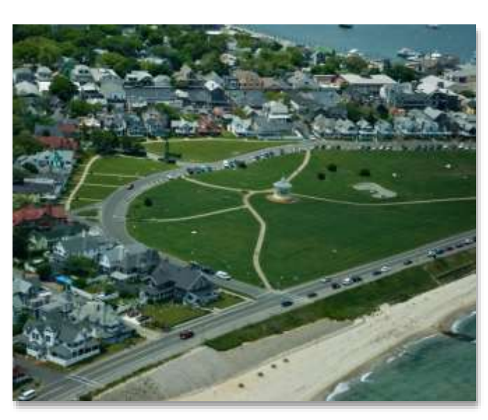
Flying over Oak Bluffs

Visitors to the Cottage Museum can view the interior of a typical Campground cottage, complete with period furnishings offering a glimpse of life on the Campgrounds in the 1800s. Also on display are vintage photographs, a selection of stereoscopic photos of Cottage City and the Campgrounds, along with other interesting documents relating to the history of the Campground.