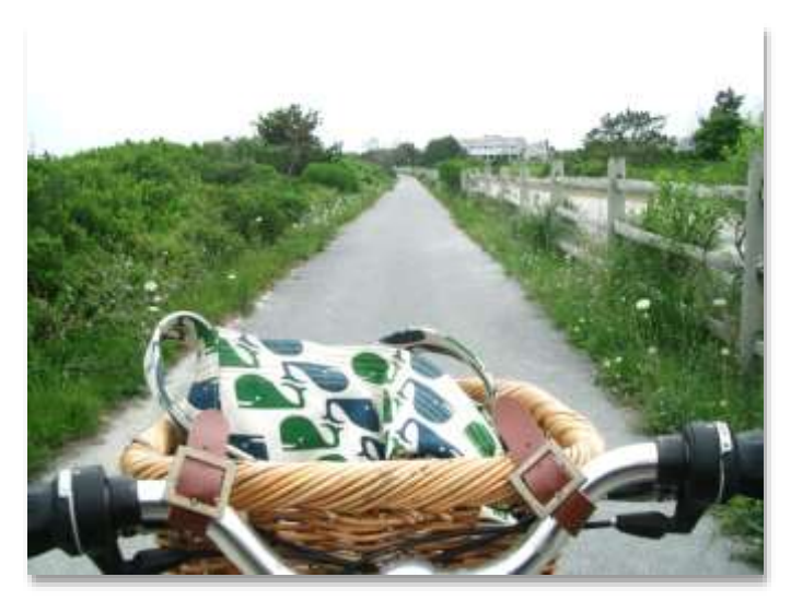
Biking on Nantucket

Nantucket, and most are separated from the roadways, making for a safe ride. Nantucket shuttle buses, equipped with bike racks, enable you to easily access any bike routes. A color-coded sign system helps guide bikers around the island.