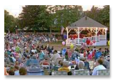
Chatham Band Concert

In parks all over the Cape and Islands, local residents assemble in gazebos in their band uniforms and present a mix of