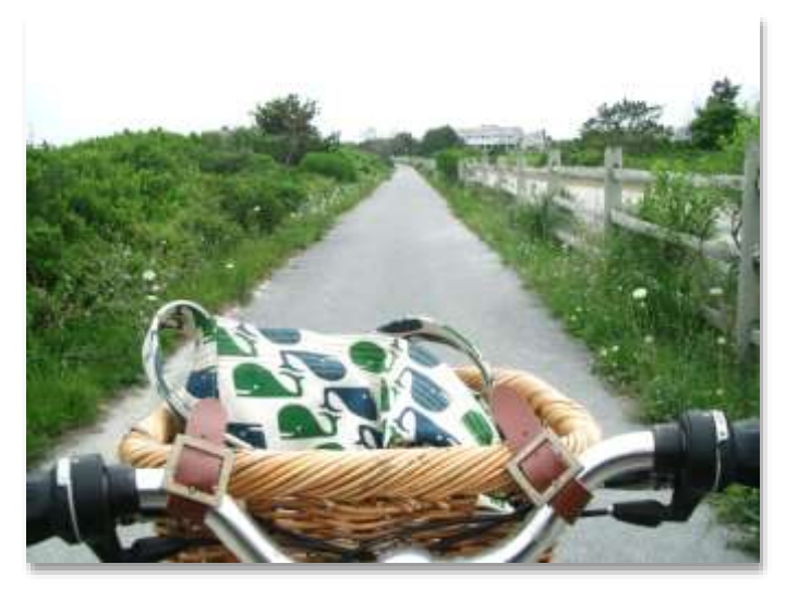
Biking on Nantucket

Nantucket, and most are separated from the roadways, making for a safe ride. Nantucket shuttle buses, equipped with bike racks, enable you to easily access any bike routes. A color-coded sign system helps guide bikers around the island.