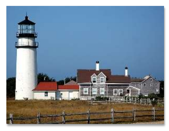
Highland Light, Truro

The waters off Cape Cod have always been difficult to navigate due to the rugged coastline, dangerous sand bars and rip tides, and too few safe harbors to enter during a storm. Over the past 300 years, there have been more than 3,000 shipwrecks on the Cape, mainly along the treacherous outer shore between Provincetown and Chatham, once known as the "Graveyard of the Atlantic."