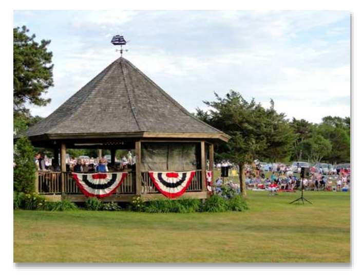
Brewster Band Concert

Small town band concerts are a part of Americana. Although these concerts are disappearing in many areas of the country, they remain a treasured and delightful part of the summer experience on Cape Cod.