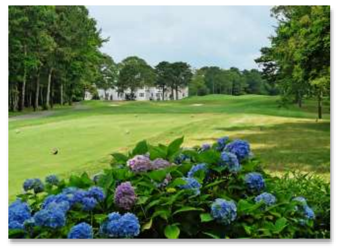
Golfing in New Seabury

The courses on the Cape and Islands are typically