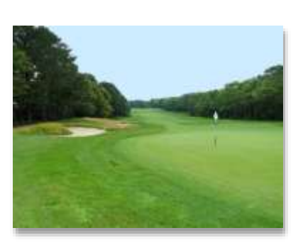
Golfing in New Seabury

set in terrain of gentle hills, fairways bordered by Cape Cod scrub pines along with some oak trees, deep fescue rough, more than a few water holes.