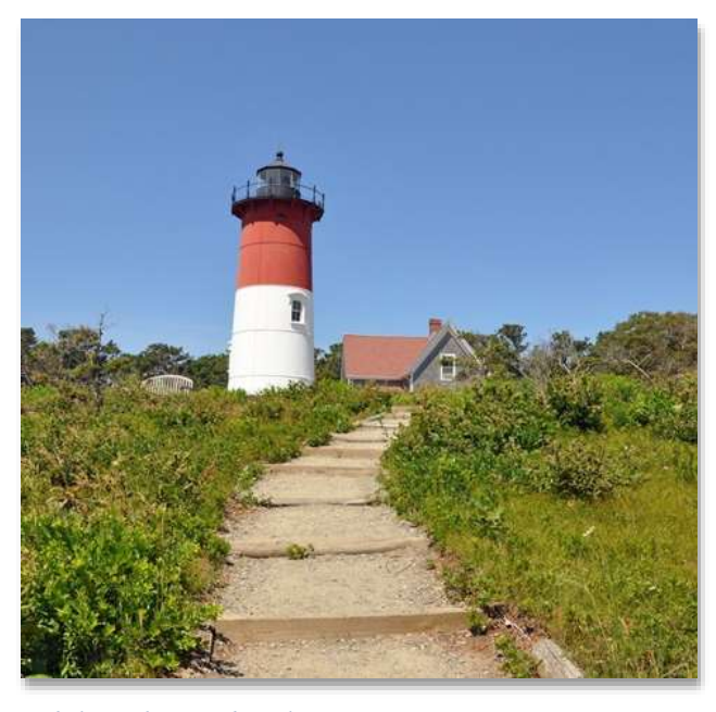
Nobska Light, Woods Hole