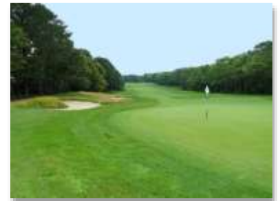
Golfing in New Seabury

set in terrain of gentle hills, fairways bordered by Cape Cod scrub pines along with some oak trees, deep fescue rough, more than a few water holes, and