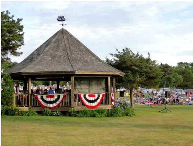
Brewster Band Concert

Small town band concerts are a part of Americana. Although these concerts are disappearing in many areas of the country, they remain a treasured and delightful part of the summer experience on Cape Cod.