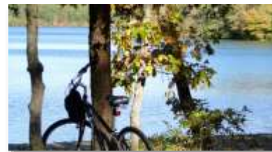
Cliff Pond – Nickerson State Park