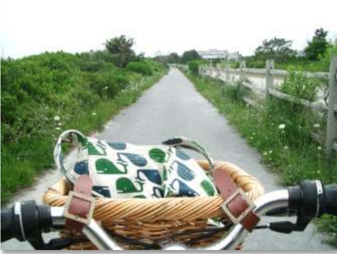
Biking on Nantucket

Nantucket, and most are separated from the roadways, making for a safe ride. Nantucket shuttle buses, equipped with bike racks, enable you to easily access any bike routes. A color-coded sign system helps guide bikers around the island.