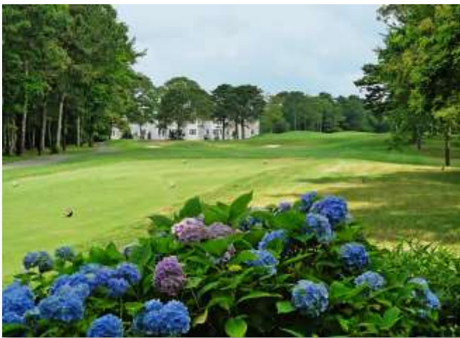
Golfing in New Seabury

The courses on the Cape and Islands are typically