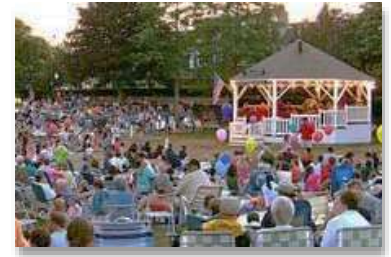
Chatham Band Concert

In parks all over the Cape and Islands, local residents assemble in gazebos in their band uniforms and present a mix of music sure to delight all and get feet tapping. While parents and grandparents relax on blankets or in folding chairs waiting for the music to begin, children run around the bandstand and play in the area set aside for dancing. Then, when the band strikes up, the dancing begins – couples, parents with their children and even solo folks enjoy swaying to the music. Adding to the Normal Rockwell-like experience at some concerts are strings of balloons rising into the summer skies.