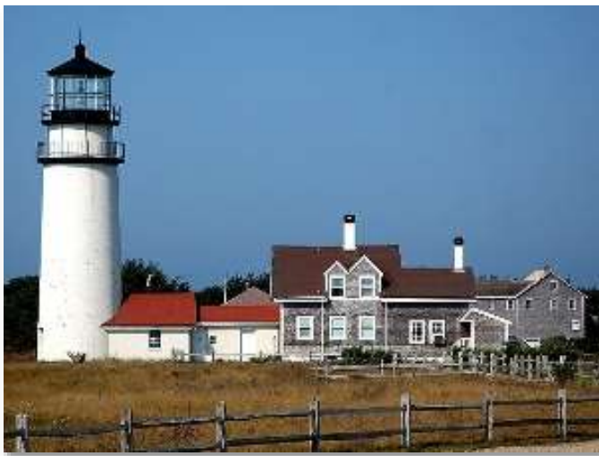
Highland Light, Truro

The waters off Cape Cod have always been difficult to navigate due to the rugged coastline, dangerous sand bars and rip tides, and too few safe harbors to enter during a storm. Over the past 300 years, there have been more than 3,000 shipwrecks on the Cape, mainly along the treacherous outer shore between Provincetown and Chatham, once known as the "Graveyard of the Atlantic."