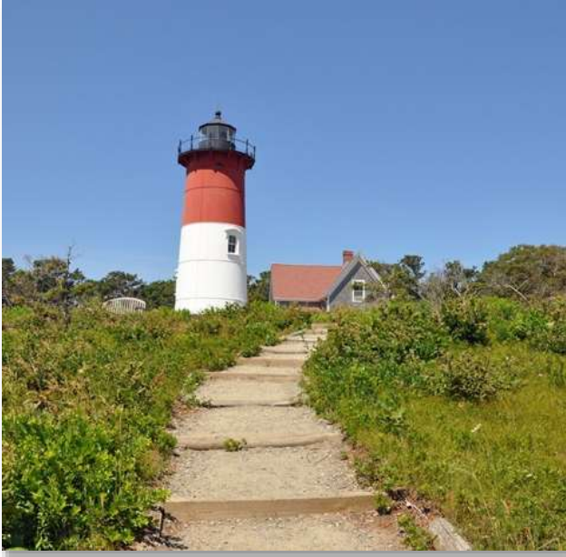
Nobska Light, Woods Hole